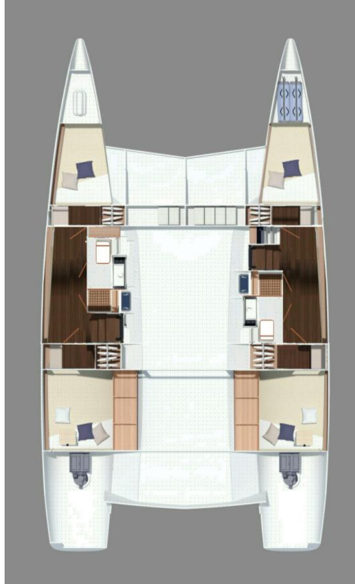
Charter - 4 Cabin/ 2 Head