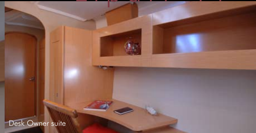
Desk Owner suite