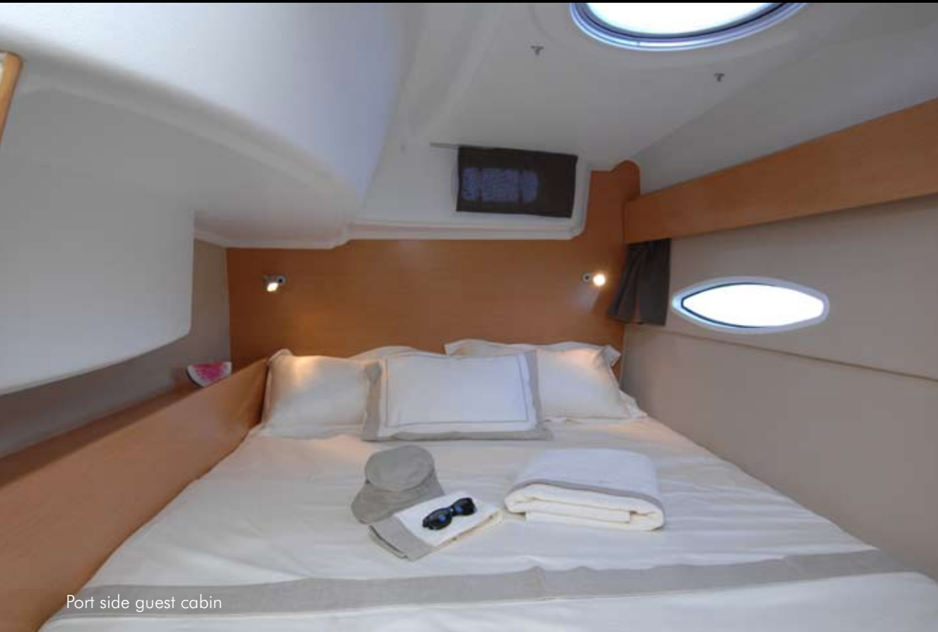
Port side guest cabin