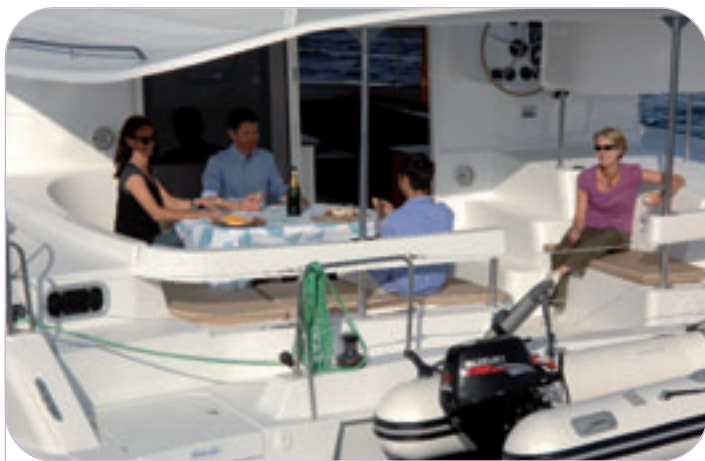
Top marks for the cockpit, which is both convivial and well-protected.