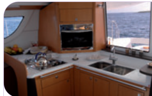
The galley offers real stowage space, which will appeal to those leaving long-term; it is also fitted with the famous 'Piano' fridge.

As the wind had dropped, we had a detailed look at the steering position. We found what we had liked so much on the 48, an ergonomic control line area, articulated around three winches and a few jammers. It is as comfortable as they come; there is enough space for three people (with a winch each?) to manoeuvre, of course, but also to look at the sea. The main traveller lines