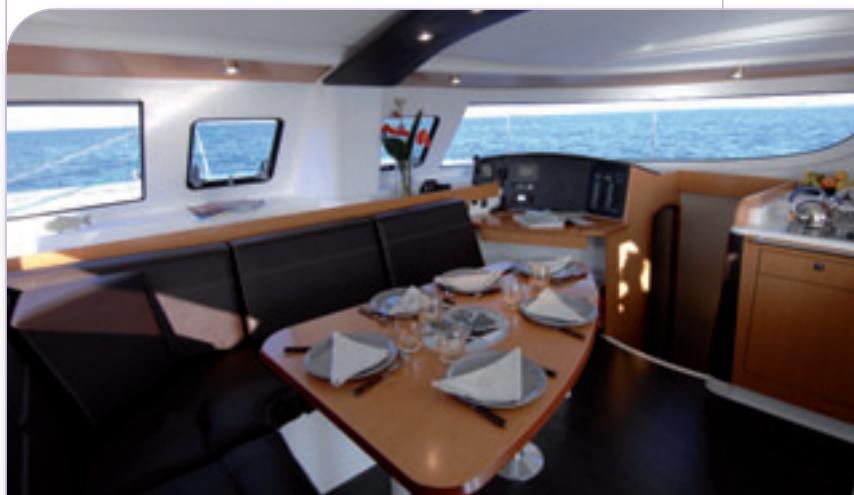
The saloon is particularly spacious, and the 'picture windows' offer an unequalled view of the exterior.