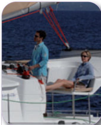
The steering position is ergonomic, articulated around three winches and a few jammers. It is extremely comfortable and can take three people. Excellent.

are led over the coachroof extension to two dedicated jammers; the sheet passes via the mast foot before also returning to its jammer. The jib sheets remain in position on their winch, and the 2:1 main halyard also has its jammer: simple, easy and efficient. This sobriety can also be found in the instrumentation, which is grouped around the steering position. The position of certain of the instruments is to be regretted, notably the autopilot control: we were obliged to juggle between the movements of the wheel (driven by its lines), to use it. The displays can be read perfectly when seated, but less easily when standing. Just aft of the winches, a locker takes the lines and avoids having them lying everywhere. The reefs