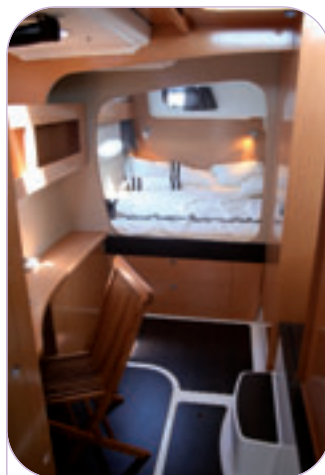
The cabins are attractive, especially the one in the owner's suite...

bility is very good; on the other hand, it is much less so to the rear, and when mooring stern-to, a crew member will be needed to indicate the distance remaining. The two engines were of course wonderful for manoeuvring in the harbour; we were already in the channel.